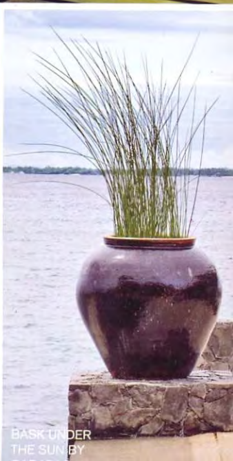
BASK UNDER THE SUNBY