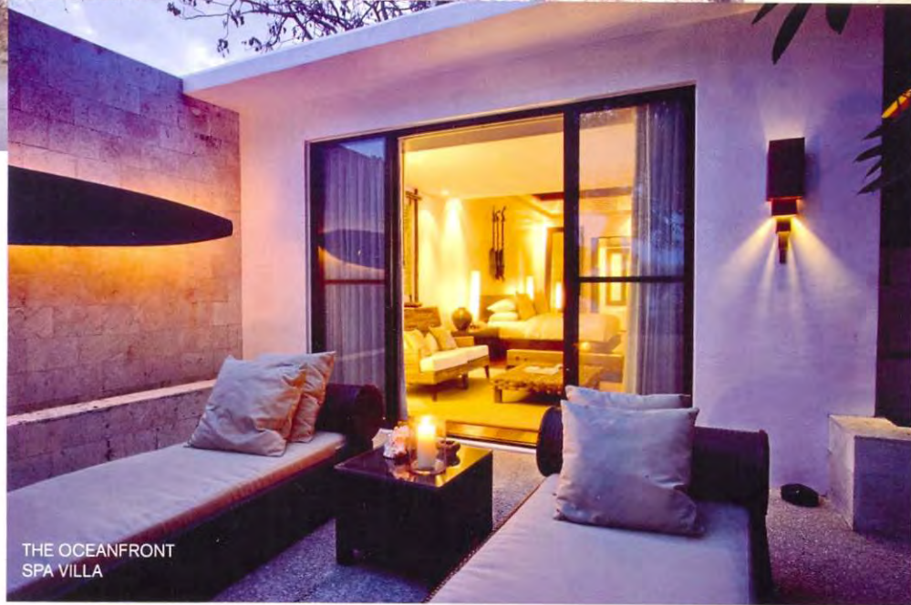
THE OCEANFRONT SPA VILLA