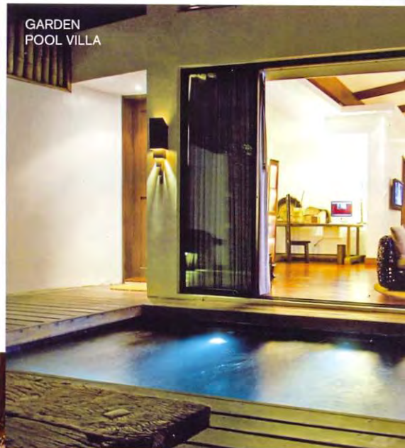
GARDEN POOL VILLA