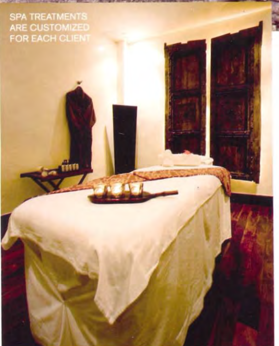
SPA TREATMENTS ARE CUSTOMIZED FOR EACH CLIENT