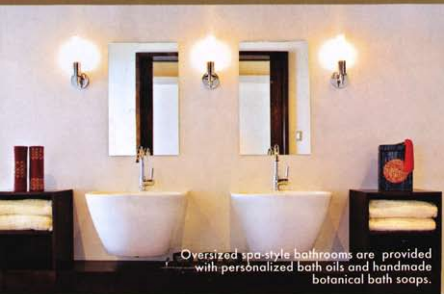
Oversized spa-style bathrooms are provided with personalized bath oils and handmade botanical bath soaps.