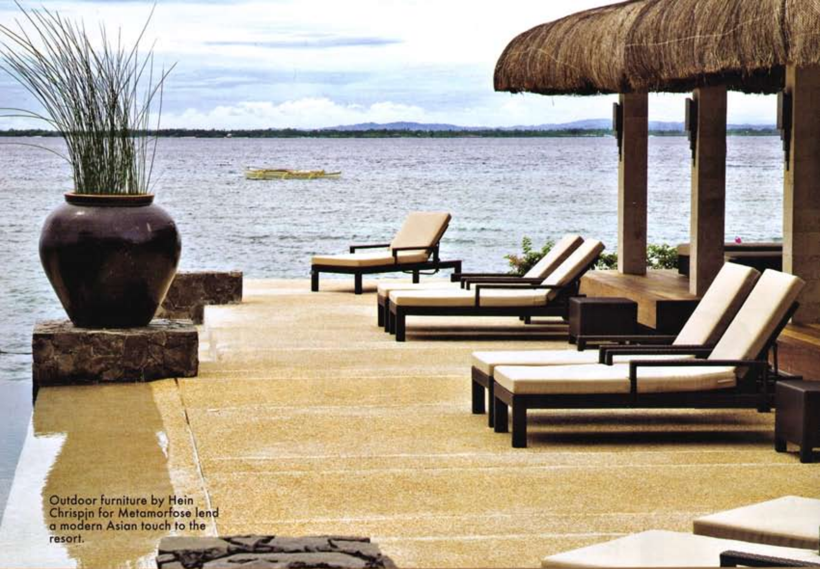
Outdoor furniture by Hein Chrispin for Metamorfose lend a modern Asian touch to the resort.