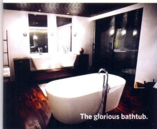
The glorious bathtub.

Looking out from my veranda, I was struck by the same granite in the swimming pool below. The faintest ripple indicated that it was, indeed, a pool, but framed by towering trees and large Asian jars, it appeared like environmental art at its subtle best. I was told that black kept the water warm, but I simply delighted in the dramatic effect.