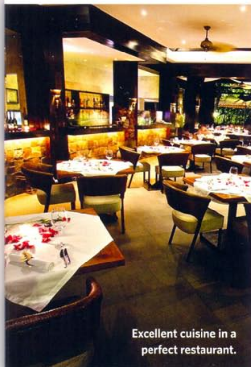
Excellent cuisine in a perfect restaurant.