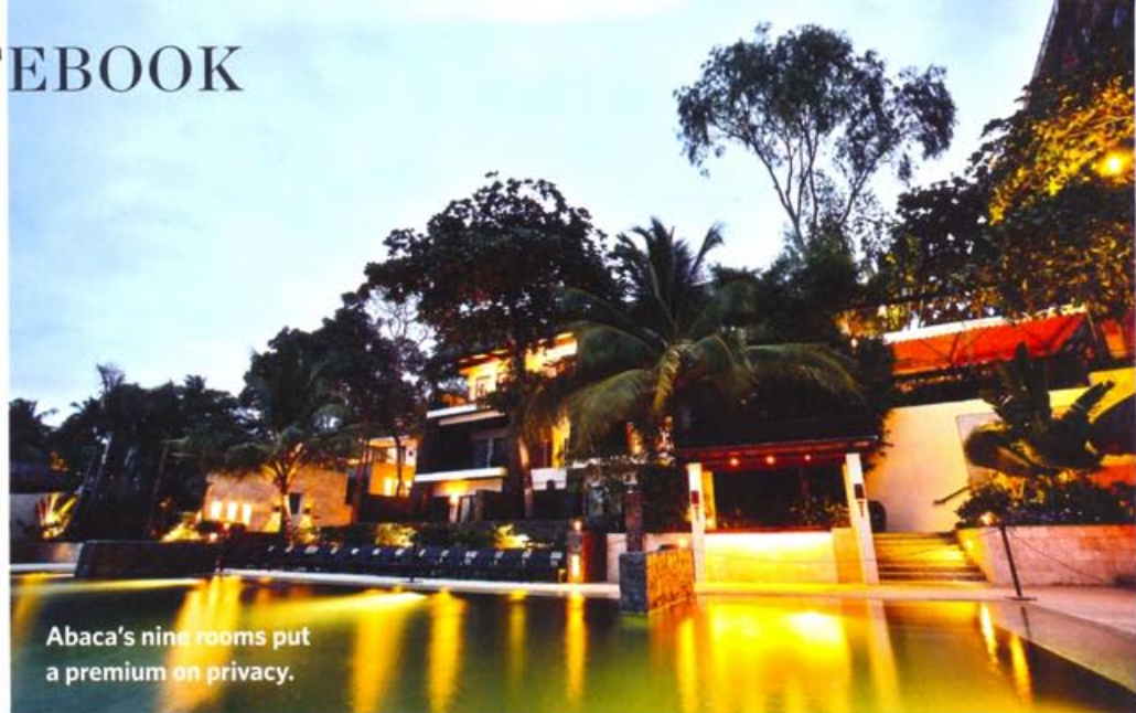
Abaca's nine rooms put a premium on privacy.